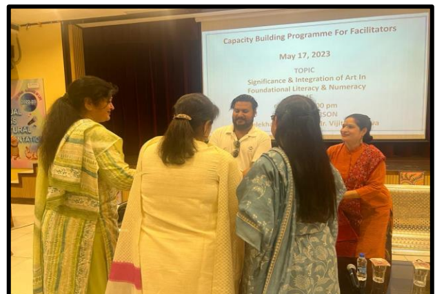
Welcoming resource person with a token of regard