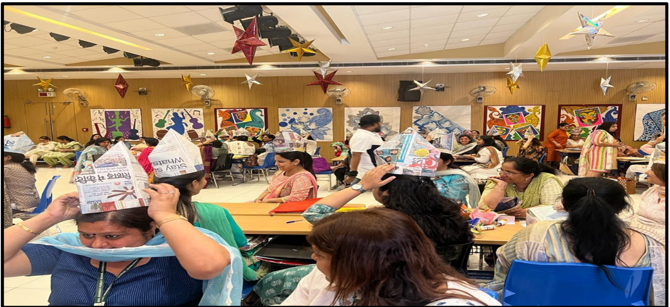
Creative fun with Newspapers