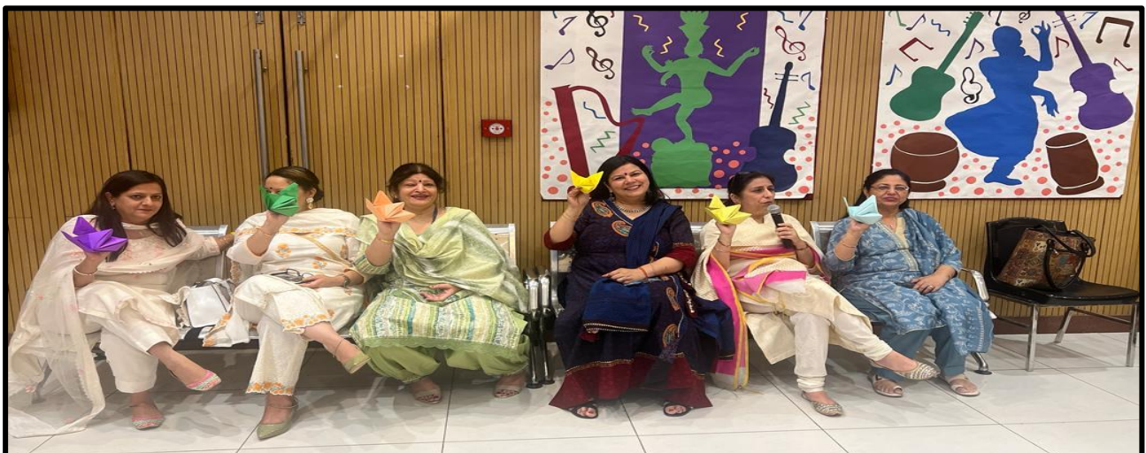
Hands on Experience – Puppet Making